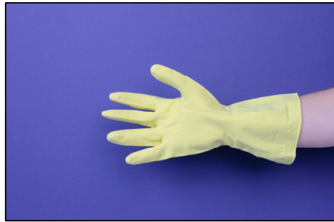
Rubber Household Glove (Yellow)