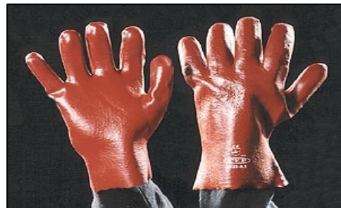
PVC Cat 2 Gauntlet Glove