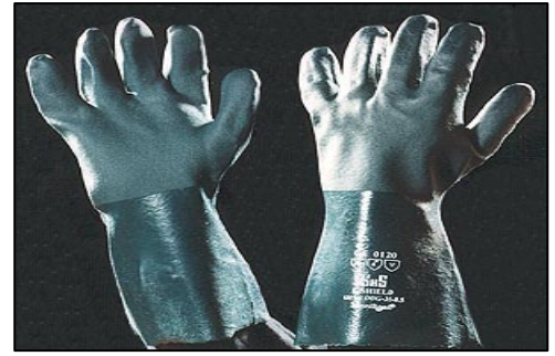
Double Dipped Cat 3 Gauntlet Glove