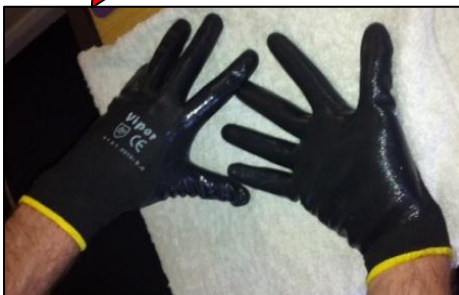
Foam Nitrile Coated Seamless Gloves