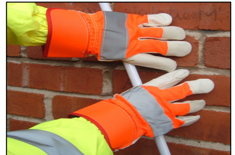
Grain Leather Hi Visibility Rigger