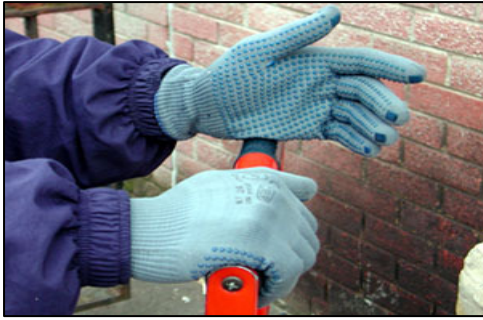
Nylon Assembly Glove (Grey)