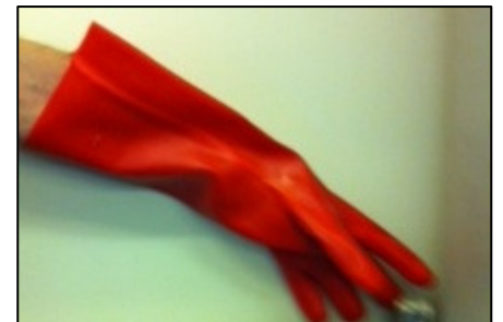
PVC Cat 2 Gauntlet Glove