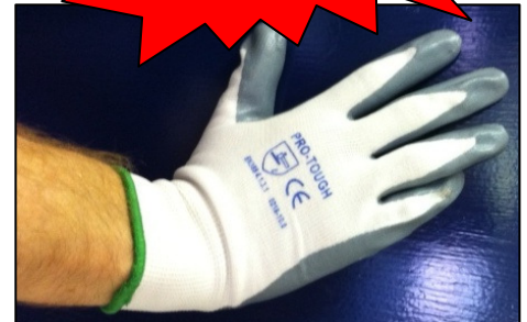
Double Dipped Cat 3 Gauntlet Glove