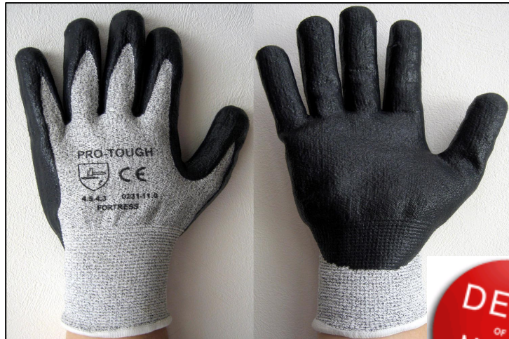
Fortress Cut Resistant Glove