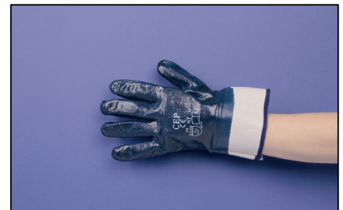
Nitrile Coated Glove – Safety Cuff