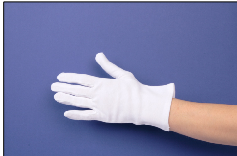
Ladies Stockinette Knit Wrist Gloves