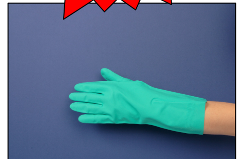
Nitrile Flocklined Glove (Green)