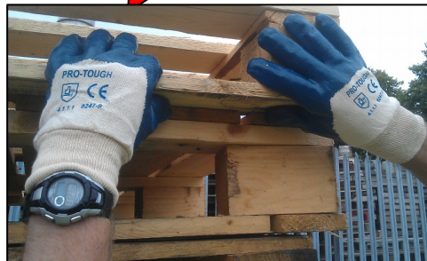
Nitrile Coated Glove – Knitted Wrist