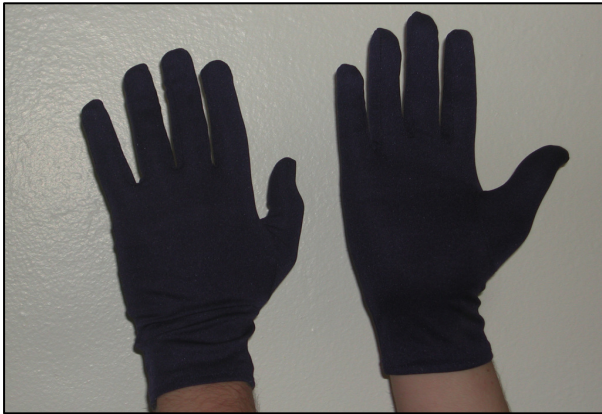
Ladies 40 Denier Nylon Glove