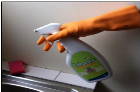
Heavy Duty Rubber Glove (Orange)