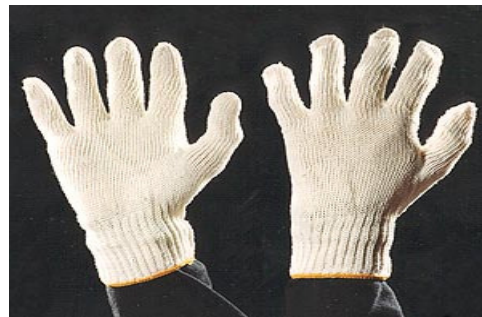
Ladies/Men's Mixed Fibre Glove