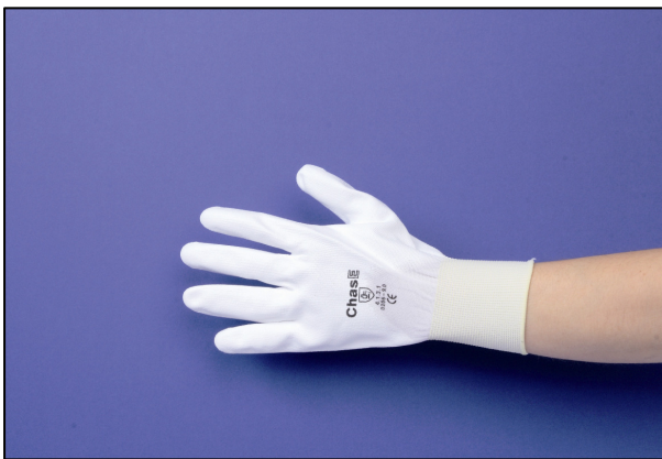
Polyurethane (PU) Coated Nylon Gloves