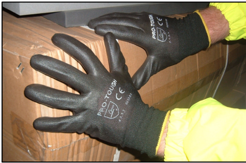
(PU) Coated Nylon Glove