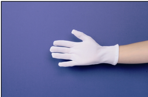
Ladies 70 Denier Nylon Stretch Glove