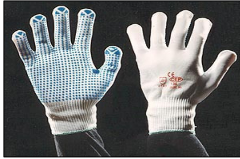
Nylon Assembly Glove (White)