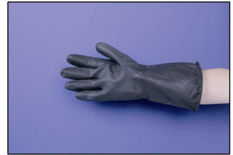
Heavy Duty Rubber Glove (Black)