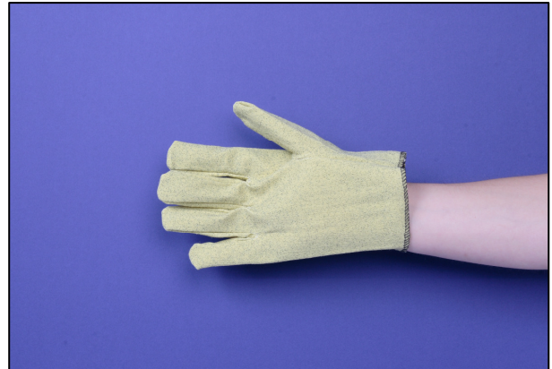
Men's PVC Vinyl Glove