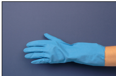
Nitrile Flocklined Glove (Blue)