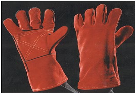
14" Double Palm Welder's Gauntlet