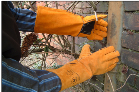
16" Split Leather Welders Gauntlet