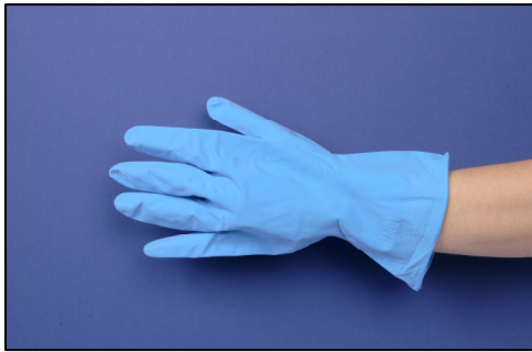
Rubber Household Gloves (Blue)