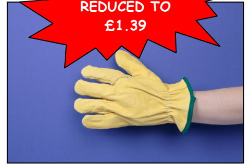
Lined Driver's Glove