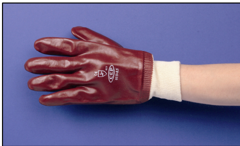
PVC Dipped glove