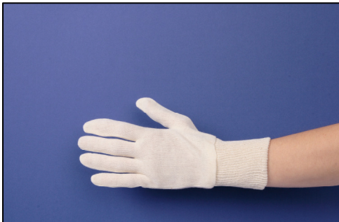
Men's Stockinette Knit Wrist Gloves