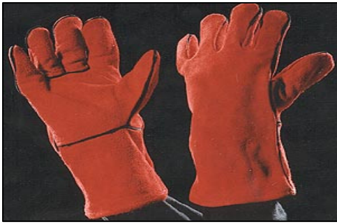
14" Welder's Gauntlet