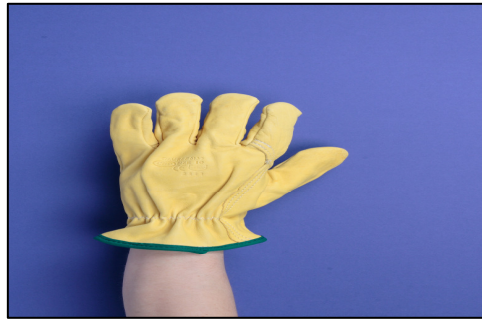
Unlined Driver's Glove