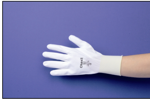
Polyurethane (PU) Coated Nylon Glove