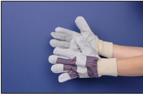
General Handling Glove