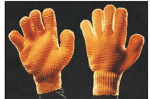
Orange PVC Criss Cross Glove