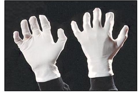
Men's 70 Denier Nylon Stretch Glove