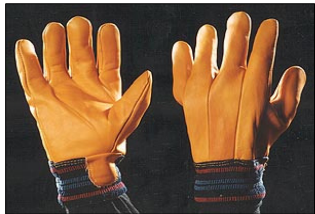
Cold Storage Glove